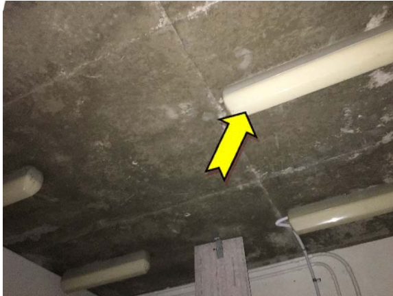
Photo 1. Interior, cashier area, ceiling – suspected PCB-containing capacitors.