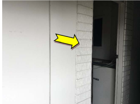
Photo 2. Interior, throughout, walls – suspected lead-containing white upper paint systems.